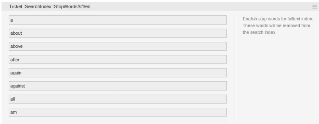
Fig. 3: Ticket::SearchIndex::StopWords###en Setting

Ticket::SearchIndex::StopWords English stop words for full-text index. These words will be removed from the search index.