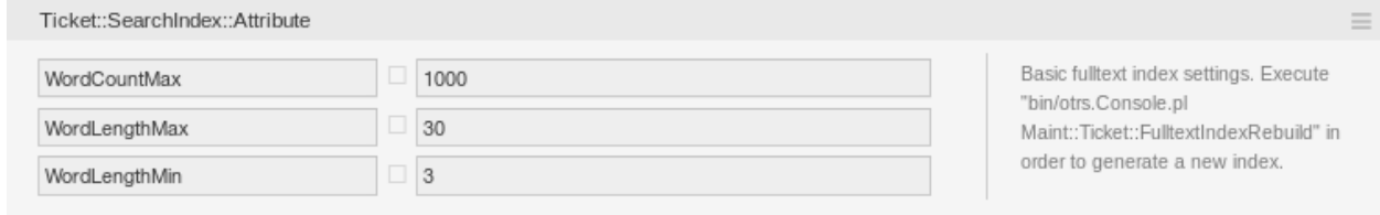
Fig. 1: Ticket::SearchIndex::Attribute Setting

WordCountMax Defines the maximum number of words which will be processed to build up the index. For example only the first 1000 words of an article body are stored in the article search index.